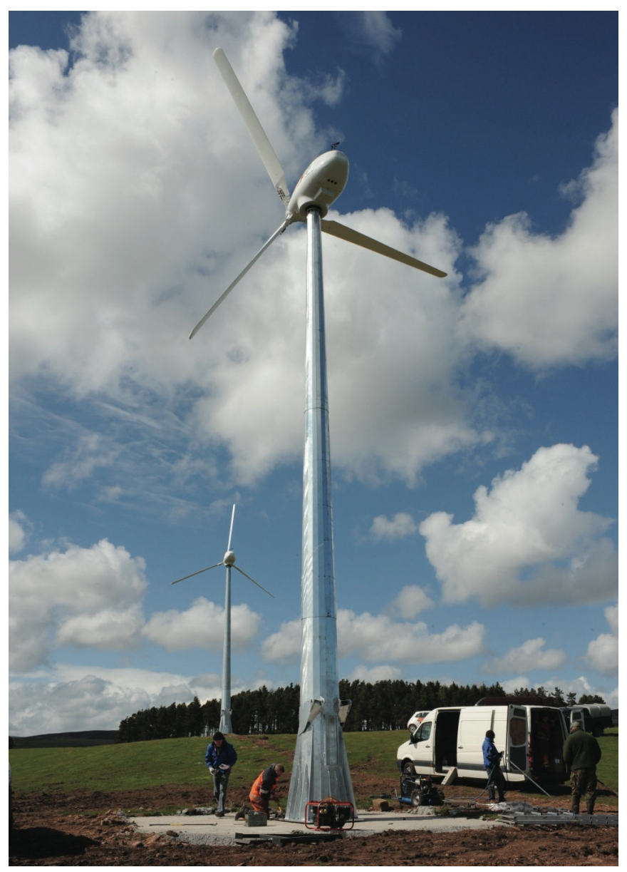
A similar twin C&F installation

For more detail search <u>www.gov.uk</u> for EIS or SEIS. If you are unsure, please seek professional advice.